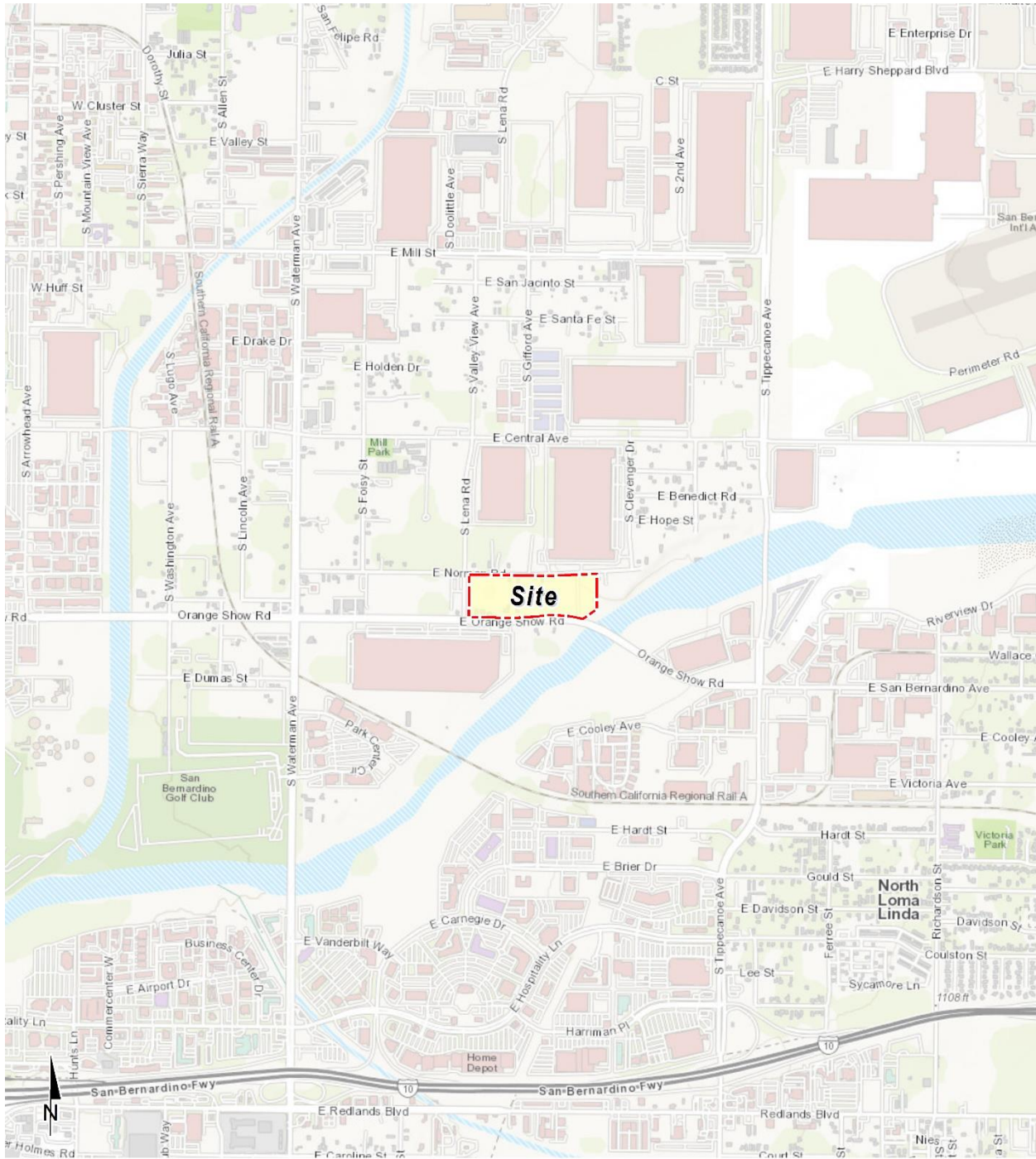
EXHIBIT 1-A: LOCATION MAP